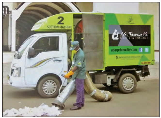
Garbage Collection Machine