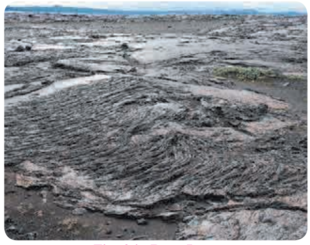
Fig. 6.4 : Ropy Lava

accessory amount of biotite and hornblende. Olivine may or may not be present. It shows compact, vesicular, amygdaloidal, pipe amygdaloidal, pillow and columnar structure. The cavities in vesicular basalts are filled with secondary minerals like heulandite stilbite, apophyllite, quartz, amethyst, chalcedony, agate, jasper, opal, calcite etc. Ropy lava structure, columnar joints are commonly observed in basalts (Fig.6.4 and 6.5).