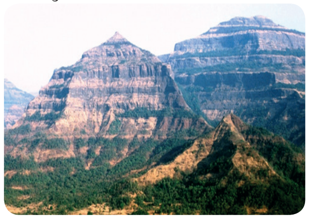
Fig. 6.3 : Stratigraphic exposures of lava flows in Malshej Ghat area of Maharashtra

districts in Vidarbha region and Ratnagiri and Sindhudurg districts in coastal Konkan. Two types of lava flows are recognized. They are the pahoehoe or ropy lava and the 'aa' or blocky lava. Pahoehoe lava flows predominate in Dhule, Aurangabad, Pune and Nasik districts, whereas in rest of Maharashtra, 'aa' lava flows are dominantly exposed. In Maharashtra between some flows intertrappean beds of lacustrine origin are found. Red bole beds commonly occur in between two lava flows. The flows are intruded by number of dolerite dykes trending nearly N-S, parallel to the west coast. East-west trending dykes are commonly exposed in northern part of Maharashtra around Nandurbar, Dhule and Jalgaon districts.