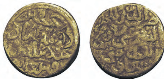
Coins of Muhammad-bin-Tughluq

During the Sultanate period there were major changes in coinage system. Instead of images of deities on the coins, the names of the Khalifa and the Sultan were inscribed on the coins. Details regarding the year of issue, place of minting etc. were inscribed on it in the Arabic script. 'Tola' came to be considered as a standard unit for the weight of the coin.