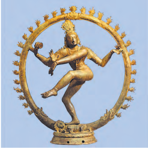
Bronze statue of Nataraj Shiva

are the best among Indian metal sculptures. Among them the most famous is the bronze statue of Nataraj Shiva.