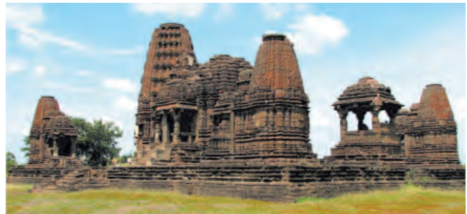
Gondeshwar Temple at Sinnar

'Lilacharitra' written by Mhamimbhatta of the Mahanubhava sect, 'Viveksindhu' by Mukundaraj, 'Bhavarthdipika' by Dnyaneshwar belong to this period. Similarly the composition of saint poets like Namadeva, Janabai, Chokhoba of the Varakari sect composed poems, which are known as 'Abhangas'. Many temples were built in this period. They are generally referred to as 'Hemadpanti' temples. The Gondeshwar temple at Sinnar and the temple complex at Anjaneri are the finest example among the temples built during this period. An important feature of the Hemadpanti temples is that no mortar is used. Instead the stones are interlocked with the help of mortise and tenon. During this period, the crucial forts of Ankai and Tankai were constructed.