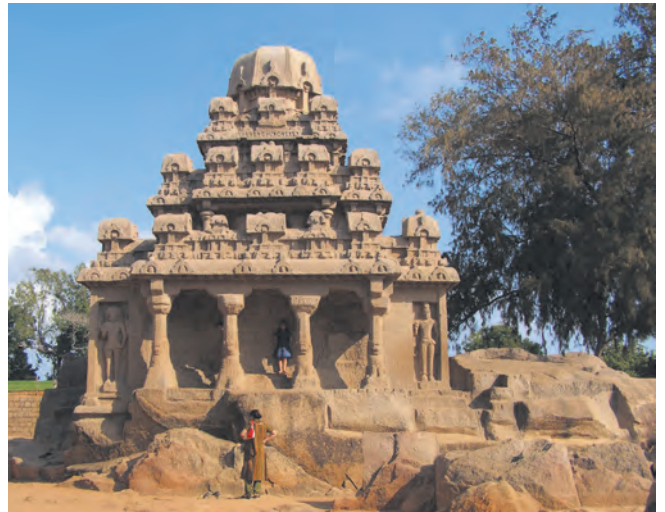
Yudhisthira Rath Temple at Mahabalipuram

were built at Tiruchirapalli, Chingalput and in east and west Arkat district. The war between Pallavas and Chalukyas took place during his period. His son Narsimhavarman defeated the Chalukyan Emperor Pulakeshi II. During Narsimhavarman's region, many temples were built at Mahabalipuram. It includes the monolithic temples (Rath Mandiras) as well. Yuan Chwang, the well-known Chinese traveller, was in his court for a certain period of time. The literary works by Narsimharvarman are important as major source of Pallava history. The Pallava rule ended in 9 th century C.E. The Chola king, Aditya, defeated the Pallavas and destroyed it.