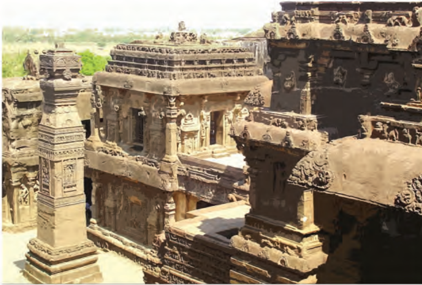
Kailas Temple at Ellora

Shilaharas : There were three branches of this dynasty – Shilaharas of south Konkan, north Konkan and Kolhapur. They called themselves as ‘Tagarapuradhiswar’ (Tagar-Ter, Osmanabad district). Jimutvahan is considered as the founder of all the three branches. They ruled for almost three hundred years as the feudatories of Rashtrakutas and later the Chalukyas.