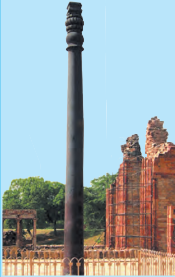
Iron Pillar : Mehrauli

You would like to know : In the Gupta period, there was remarkable progress in making alloys and casting of metals. The