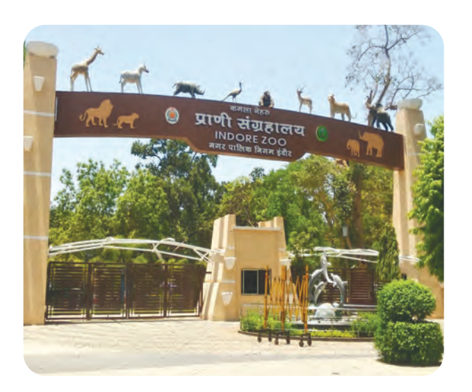
Fig. 1.4 Zoological Park

Flora, manuals, Monographs and Catalogue are some other tools of maintaining biodiversity records. Flora is the plant life occurring in a particular area on time. A Monograph describes any one selected biological group where as manual provides information, keys about identification of species found in a particular area.