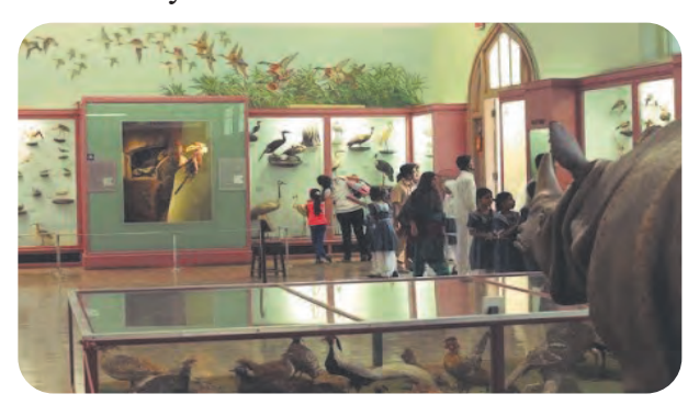
Fig. 1.3 Biological Museum

Thus, biological museums in educational institutes are reference hubs of biodiversity studies.