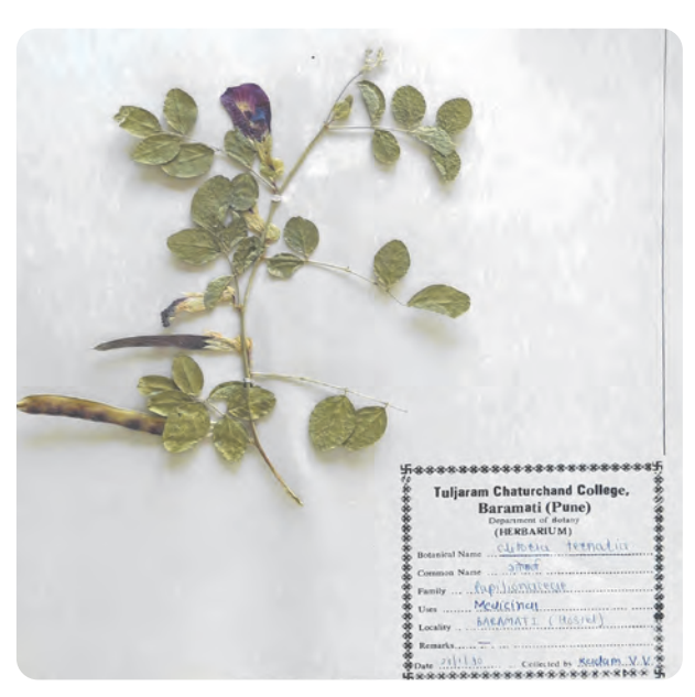
Fig. 1.1 Herbarium

Date, place of collection along with detailed classification and highlighting with its ecological peculiarities, characters of the plant are recorded on the same sheet. Local names and name of the collector may be added. This information is given at lower right corner of sheet and is called 'label'.