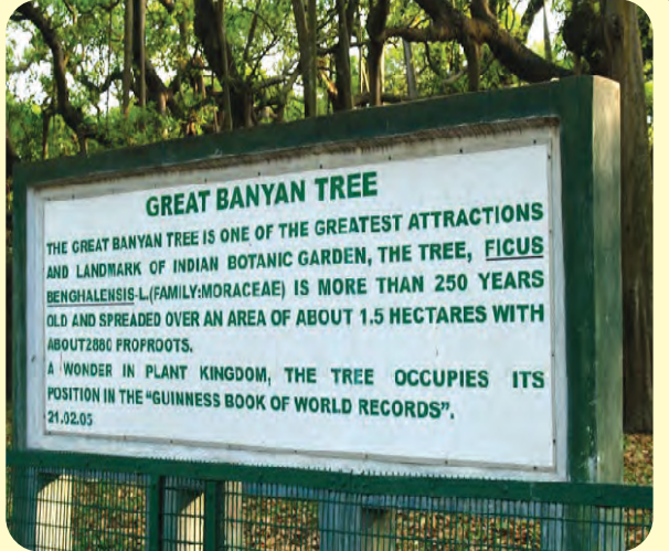
Fig. 1.2 Botanical Garden: Kolkata 255 years old Banyan tree