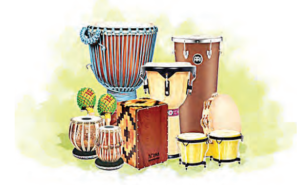
Examples of material culture

Non-material culture: Non-material culture refers to ideas created by human beings. The nature of non-material culture is abstract and intangible. For e.g. norms, regulations, values, signs and symbols, knowledge. beliefs Non-material etc. culture is further divided into cognitive and normative aspects of culture. The cognitive aspects refer to understanding as well as, how we make sense of all the information around 118. e.g. ideas knowledge, beliefs. The normative aspects consist of folkways, mores, customs, conventions and laws. These are mainly values or rules that guide social behaviour.