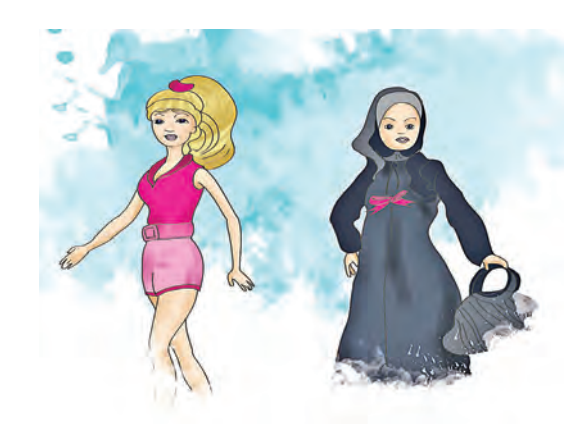
Hybrid version of Barbie