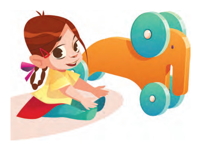
Fig. 4.3 Child in nursery

This stage extends from 2 years to about 6 years. This age is also called preschool age. Child develops control over his muscles. Child becomes physically independent. The physical territory of the child increases, so automatically child learns about social behaviour. Child asks number of questions to others. Hence this age is called as 'questioning age' or the 'age of curiosity'.