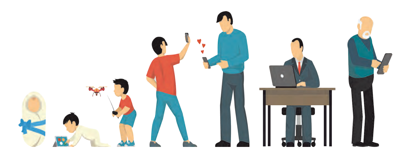
Fig. 4.5 Life span: from infancy to old age