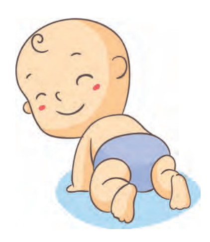
Fig. 4.2 Infant

This stage ranges between 2 week after birth to 2 years. During this stage rapid physical and motor development takes place. Within 2 months child can turn his head. Child can sit and walk with support by 9 months. Child starts walking independently by around 12th months of age.