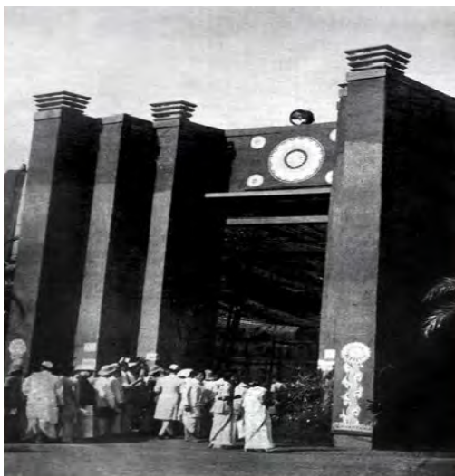
Venue of the Asian Relations Conference, Delhi

establish their independent identity. This process of regional level cooperation is also called regionalism. While geographic linkages are important, sometimes some functional issues become the basis of regional cooperation. These can be in areas like transport and communication, energy, health, etc. The process of regionalism usually begins with a political dialogue amongst the participants. Such a dialogue may lead to the creation of an organisation. Organisations like the European Union (EU), Association of South East Asian Nations (ASEAN) or South Asian Association for Regional Cooperation (SAARC) are examples of such regional groupings.