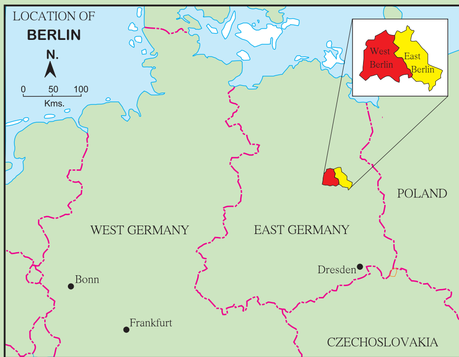
Map showing location of Berlin

divided between East and West Berlin. East Berlin was under Soviet influence while West Berlin was under American, British and French control. The city of Berlin lies inside the territory of East Germany. Thus, West Berlin was surrounded by East Germany from all sides.