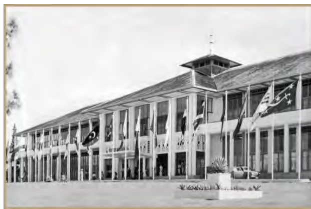
Venue of the Afro-Asian Conference, Bandung

The Bandung Conference was a historic event. It tried to spread the concept of regionalism to Asia and Africa.