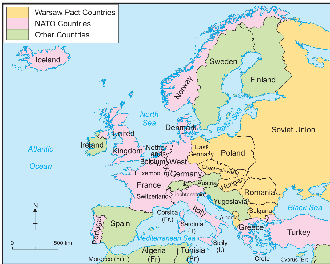
Military Alliances: NATO and Warsaw Pact