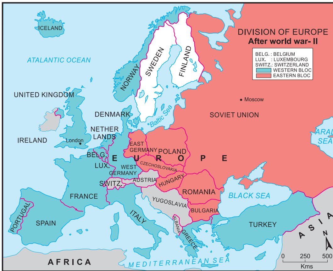
Division of Europe after World War II