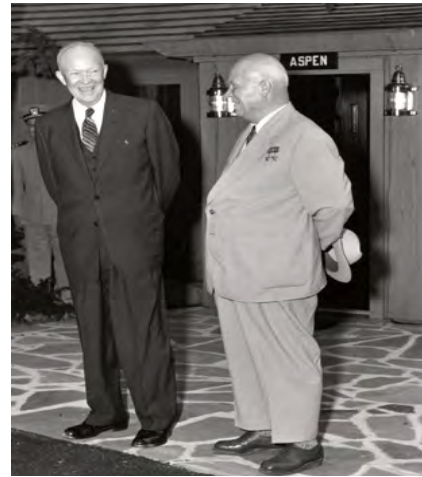
President Dwight Eisenhower of the US and Prime Minister Nikita Khrushchev of the Soviet Union at Camp David (1959)

seeking a dialogue between the two cold war rivals.