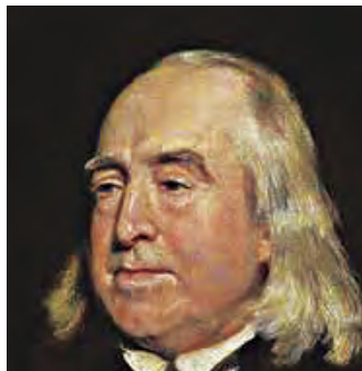
Jeremy Bentham (1748 -1832) an English philosopher

Rousseau did not consider liberty as a natural right as advocated by Hobbes and Locke. He believed that the society comes together to protect the life and interest of the individual. Therefore he gave more importance to emancipation from social inequality. He also stressed the freedom of choice and availability of favorable conditions in the concept of liberty.