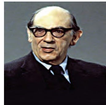
Isaiah Berlin (1909- 1997) Russian-British, philosopher and historian of ideas.

In his famous essay, ‘Two Concepts of Liberty’, first published in 1958, Isaiah Berlin has discussed about Negative and Positive liberty. Positive liberty emerged from modern liberalism, whereas, negative liberty emerged from classical and neoclassical liberalism. Isaiah Berlin believed that liberty is unrestrained.