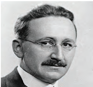
Friedrich Hayek (1899-1992) an Anglo-Austrian philosopher

Fredrick Hayek and Robert Nozick have also explained the concept of Negative Liberty. Fredrick Hayek was a neo-liberal thinker and an individualist. He described liberty as a hurdle-less situation. He opposed state interference in an individual's life. He advocated economic freedom. According to him economic freedom is true liberty. There should not be any control or restriction on true liberty.