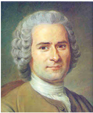
Jean-Jacques Rousseau (1712-1778) a Genevan philosopher

perspective. According to him an individual should keep personal interests aside for social interests. His concept of liberty frees the individual from a class based system and inequality. According to him inequality is an obstacle in the attainment of liberty. He maintains that liberty frees an individual from the hurdles created by the rise of civil and political society. He describes two hurdles on liberty: (i) One which prohibits an individual to think about public interest. (ii) One which is created due to inequality in society.