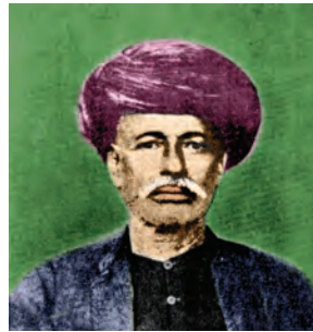
Mahatma Jyotirao Phule (1827-1890) an Indian social activist and a thinker

individuals faced a sense of subordination in social life. An end to this subordination is another dimension of liberty. For example, ending of humiliation and insult, gender inequality, superiority-inferiority complex. They also suggested liberation of lower castes from the domination of the upper castes as an essence of liberty.