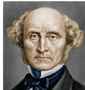
John Stuart Mill (1806-1873) a British philosopher

John Stuart Mill : Mill has supported individual liberty and opposed unrestrained