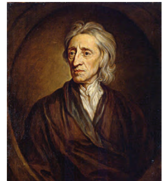
John Locke (1632- 1704) an English philosopher

John Locke : Locke considers liberty as natural right of an individual. He has explained the concept of liberty within the context of morality. It is morally wrong to hurt the right of life and liberty of any individual. One should enjoy liberty without affecting the principle of equality. Liberty is an integral part of an individual. He has given great importance to liberty. He maintains that all human beings are rational; therefore liberty should be enjoyed rationally. He does not advocate unrestrained freedom. In short, Locke's concept of liberty focuses on absence of restraint and freedom of choice.