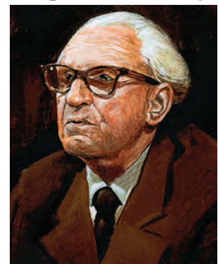
Herbert Marcuse (1898-1979) a German- American philosopher.

Marcuse has explained his thoughts about positive liberty in his books, 'One Dimensional Man' and 'Eros and Civilisation'. He said, "Scientific and technological development, has increased standard of living but has not reduced inequality in society". This has obstructed cultural development of the society.