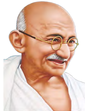
Mahatma Gandhi (1869-1948) Leader of the Indian Independence movement

He spelt this out in his work, ' Hind Swaraj '. The term Swaraj implies a combination of two ideas: Self (Swa) and Rule (Raj). Swaraj means Self-Rule. His concept of Swaraj was comprehensive. Mahatma Gandhi did not accept Swaraj