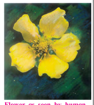
Flower as seen by an insect Flower as seen by human