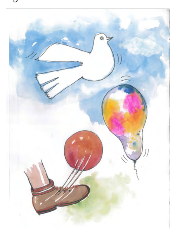
Different causes of Motion

One more question follows - Are the fundamental elements dynamic by nature or are they accelerated by someone? It is a quality of animals to be able to move without any outside force. Things have to be set to motion. Explanation of motion and changes caused by motion is very much necessary for any theory regarding the nature of the world. Philosophers who believe the fundamental elements to be dynamic proclaim that various worldly entities come into existence due to the movements, the coming together and falling apart of the elements. According to the philosophers, these movements follow the laws of physics, they aren't driven by a purpose and they create all beings.