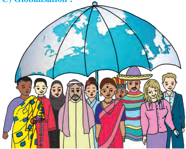
Fig. 9.3 : Globalisation