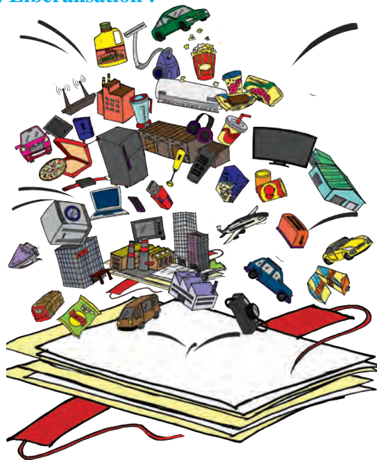
Fig. 9.1 : Liberalisation

Meaning : Liberalisation refers to 'economic freedom' or 'freedom for economic decision'. It means producers, consumers and owners of factors of production, are free to take decision to promote their self interest. Adam Smith in his book, 'Wealth of Nations' suggested that economic liberalisation is the best economic policy to promote economic growth and well being of the people.