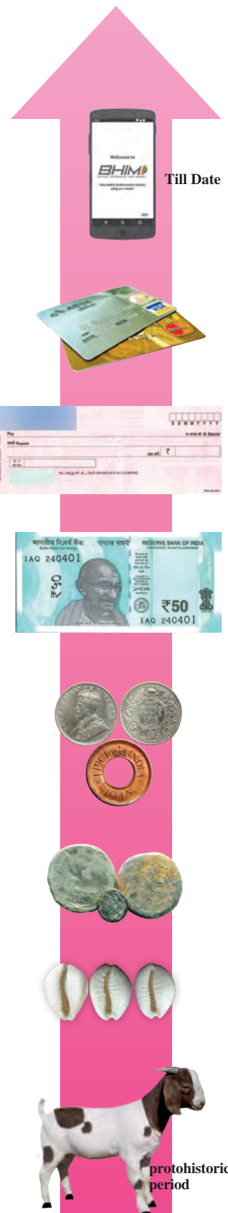
Fig. 2.2 : Evolution of Money