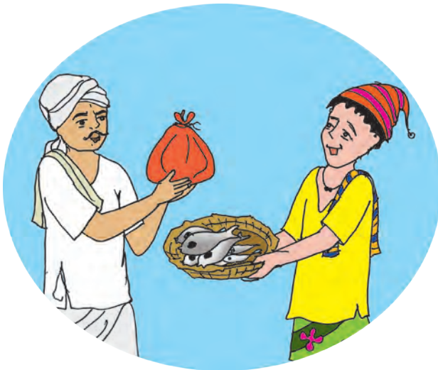
Fig. 2.1 : Barter system

Man is an intellectual animal. The invention of money is one of the important and fundamental inventions out of various inventions in the world. According to Crowther, there is a basic invention in each branch of knowledge, e.g. invention of fire in science, invention of wheels in mechanical science. The concept of money is an important concept which has brought about a revolutionary change in the economic life of human beings. Various goods and services are bought and sold with the help of money, to satisfy human wants. Modern economy is dependent on money. Money which is in circulation today was created to reduce the difficulties in Barter System.