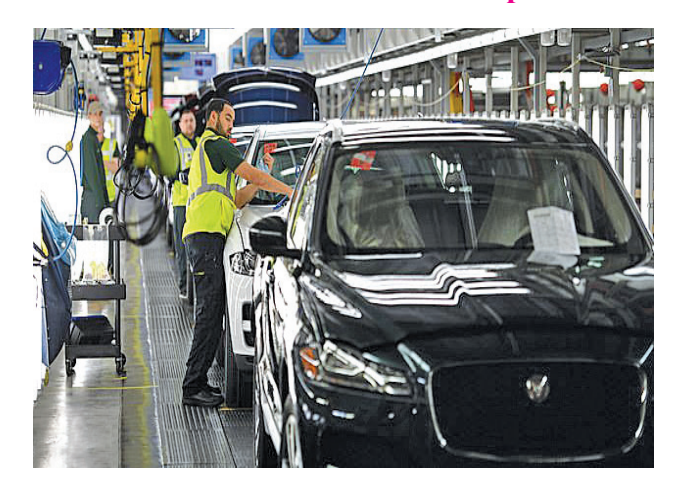
Tata's Jaguar Land Rover in UK