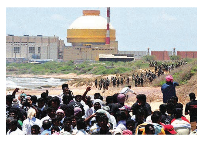
Agitation against Kudankulam nuclear plant