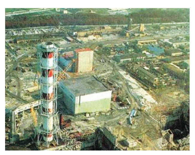
Chernobyl nuclear power plant after the explosion