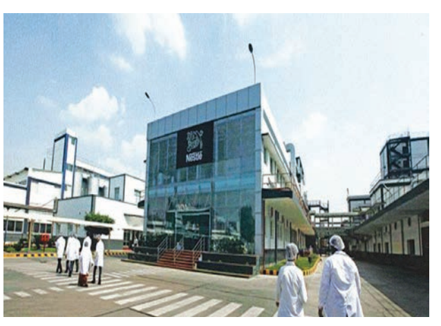
Nestlé in India