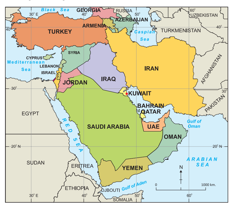
Map of Kuwait and Iraq

Not much opposition was possible against the United States and eventually the meaning of the term 'New World Order' which implied American dominance and leadership in matters of security was accepted at the global level. This was the first expression of the unipolar world order.