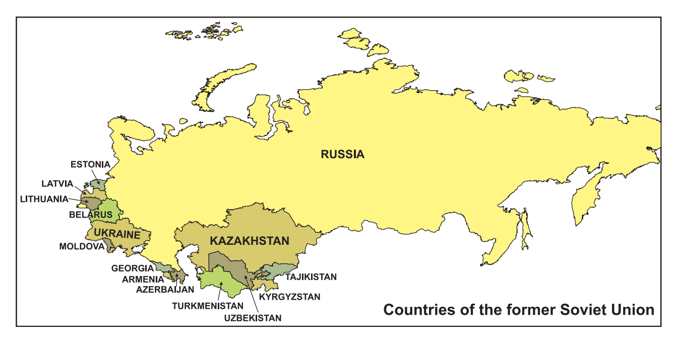
Countries of the former Soviet Union