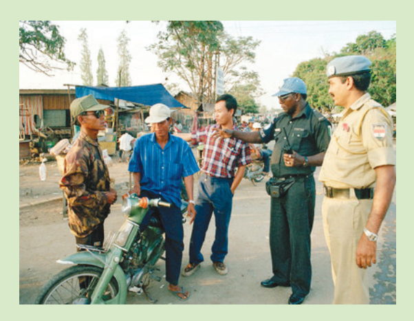
Indian Police Officer in Cambodia

UN Operations in Somalia (UNOSOM - II) March 1993 to December 1994: India played an active role in United Nation's campaign in Somalia. The Indian contingent of the UN Peacekeepers successfully provided humanitarian relief. It dug a large number of wells, constructed schools and mosques, and ran mobile dispensaries and relief camps, provided medical as well as veterinary care. It also carried out rehabilitation of thousands of refugees and assisted in their repatriation.