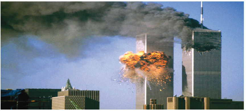
Terrorist Attack of 11 September 2001

or the threat to use violence with an intention to create panic in the society and pursue political, religious or ideological goals. Generally, government institutions and officials are primary targets.