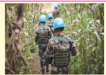
UN Peacekeeping Force

The United Nations does not have its own army. But in order to maintain international peace and security member states of the United Nations have created a peacekeeping force out of their own military resources.