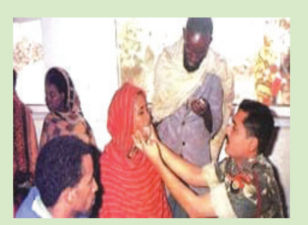
Indian Army Doctors in Somalia